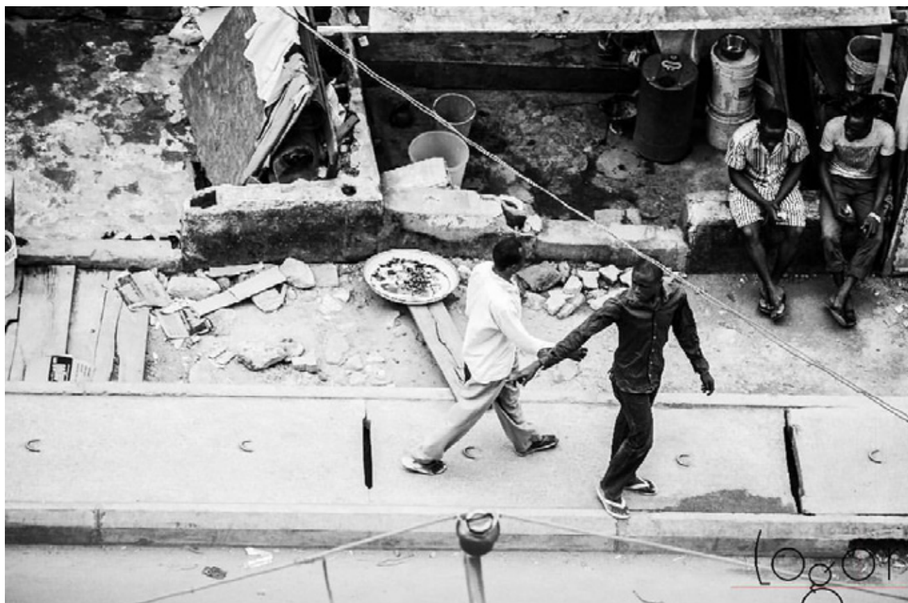
Oluwamuyiwa Logo When I played God 2015