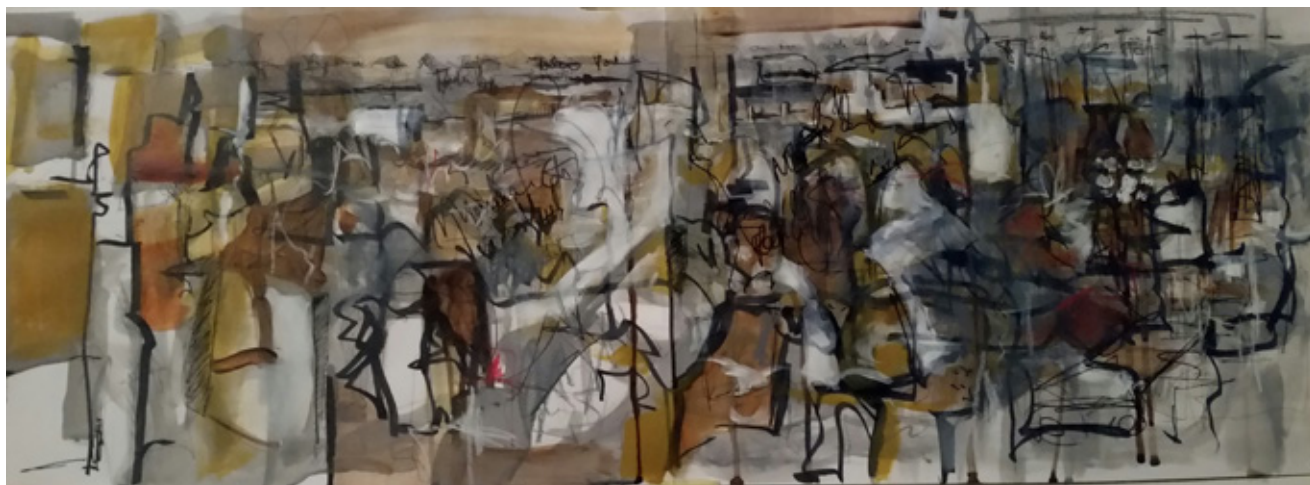
Richard Ketley Four Short Stories of Lagos Mixed media on paper 2015