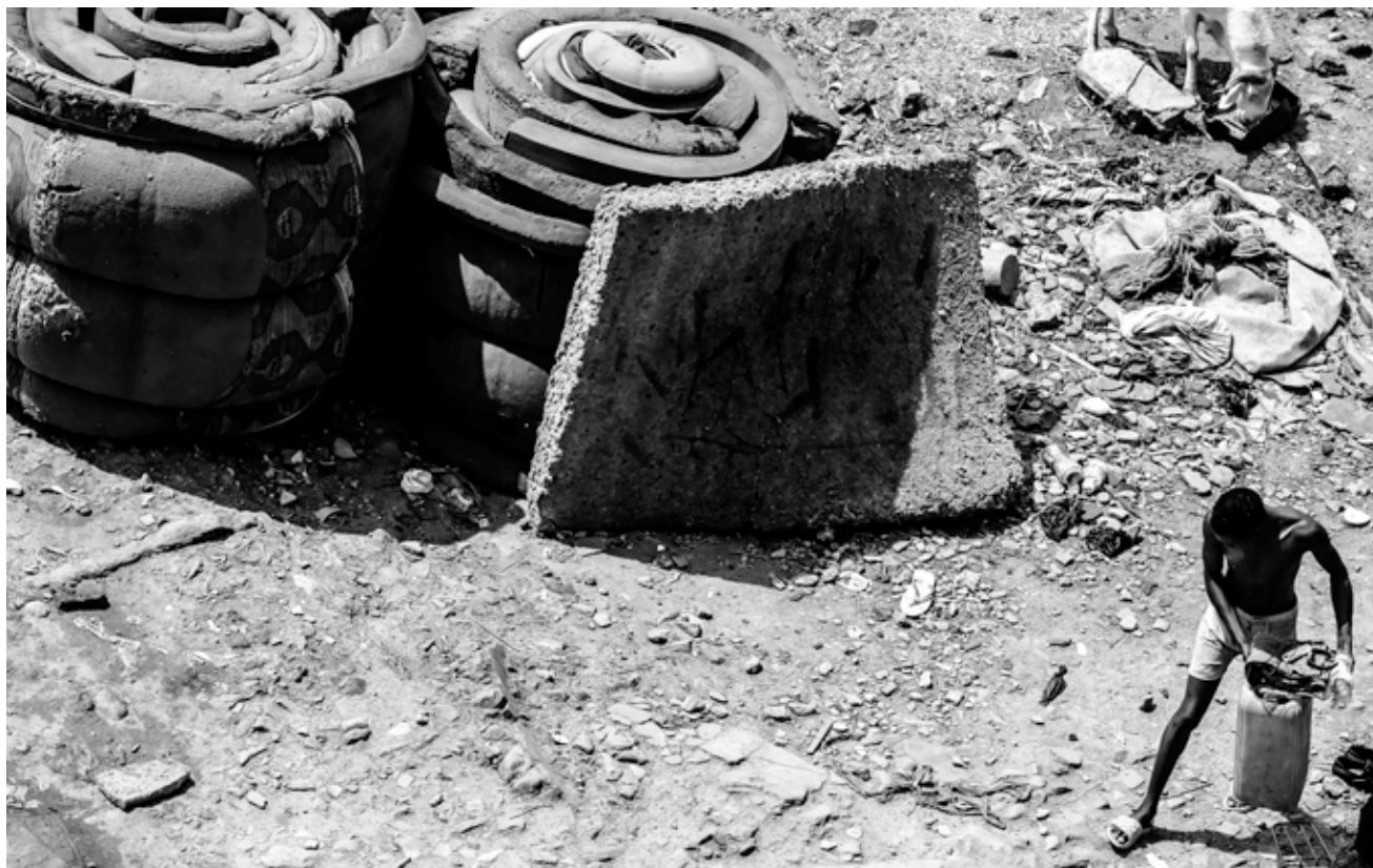
Oluwamuyiwa Logo Foam/Form 2015