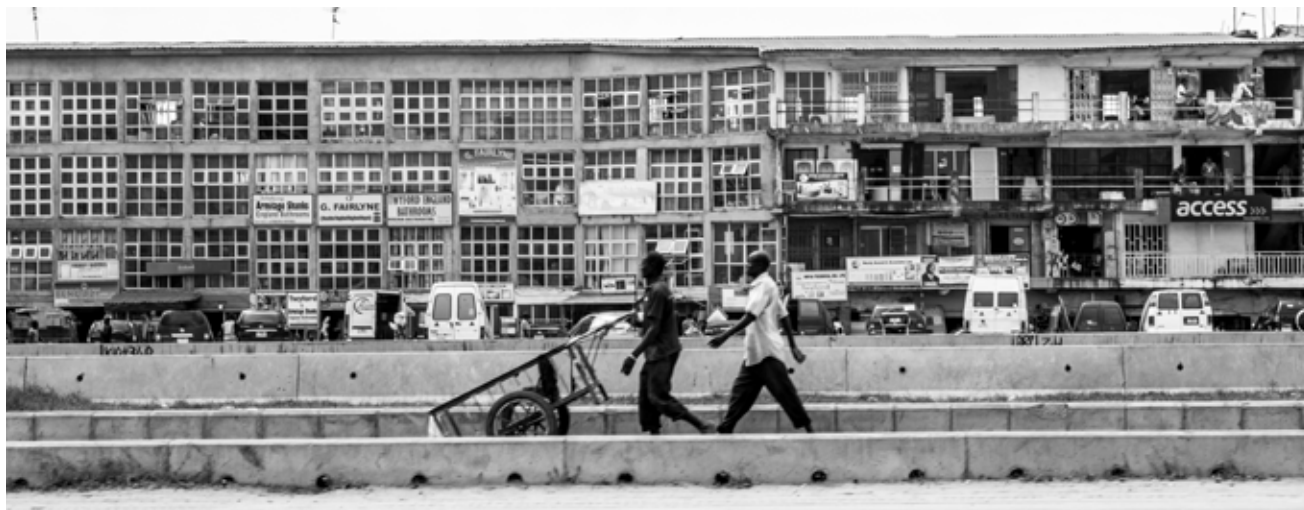
Oluwamuyiwa Logo Street Scene Doyin-Orile, Lagos 2015