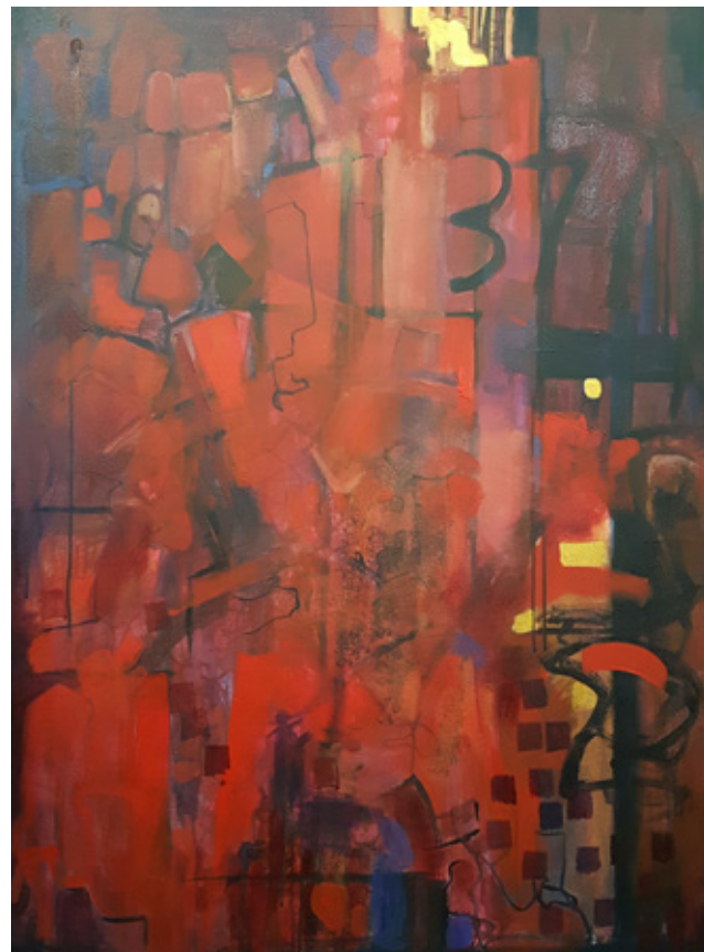
Richard Ketley / Abstract: Lady at bus stop / Oil on canvas / 2016