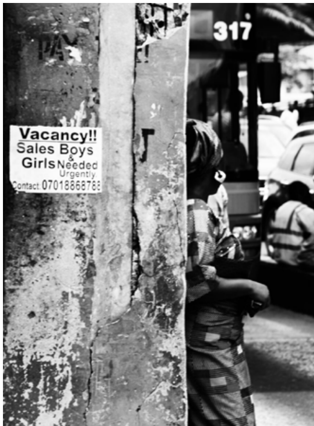
Oluwamuyiwa Logo / Lady at bus stop / 2016