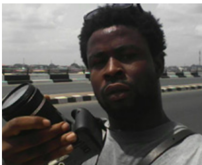
OLUWAMUYIWA LOGO FEBRUARY 2016