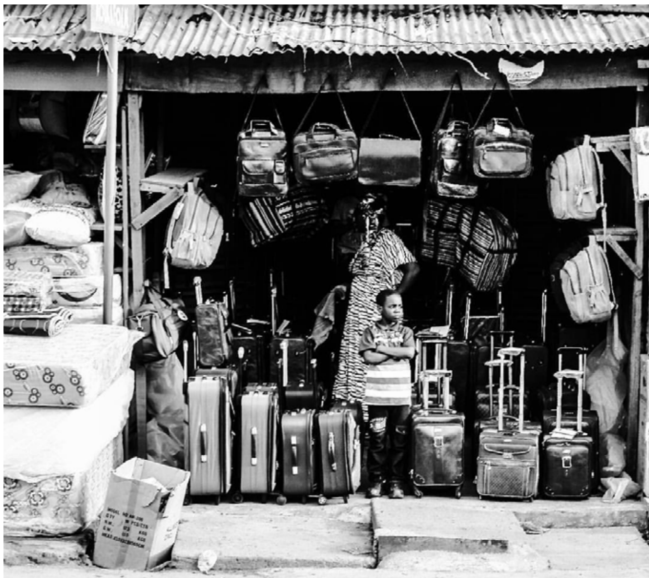
Oluwamuyiwa Logo Life is a journey 2015